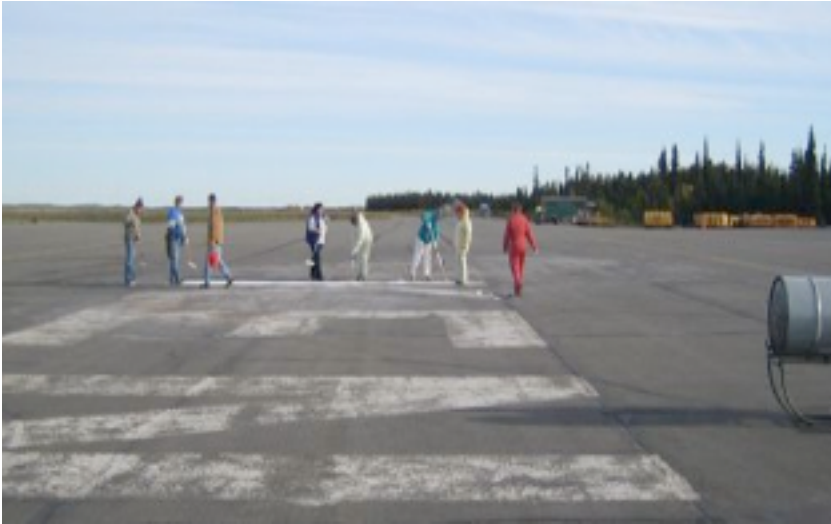
99s getting ready to start a badly needed repaint at Kenai.

We are planning to have lots of work for next spring and summer. More information will appear in the Flypaper in the Spring as plans are confirmed.