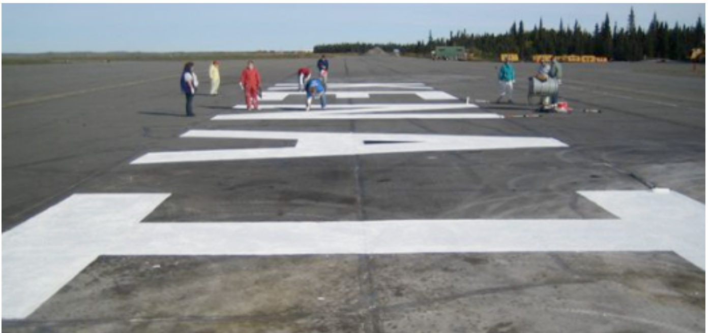
Surveying a job well done!