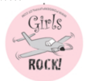
New Button Design

Recorded at the Veteran's Memorial Building in Santa Rosa, California on September 19, 2009, six women relive exciting adventures of tow-targeting and flying over 77 types of aircraft to over 134 bases.