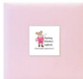
Logbooks for Aspiring Aviators

For more information, go to the website: www.powderpuffpilot.com