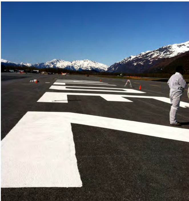
Looking down the air marking from the "Z"—clear skies and beautiful mountains.

The air marking (repainting the airport name) took place Friday morning before the fly-in activities were to begin. The biggest challenge was the wind, but the job got done. Four 99s and 2 extra helpers completed the job. Patty Livingston, Sara Downing and Denise Koehrer were there from the Mat-Su Valley Chapter and Melanie Hancock attended from the Alaska Chapter. Ernie Koehrer and Herb Hancock assisted the 99s.